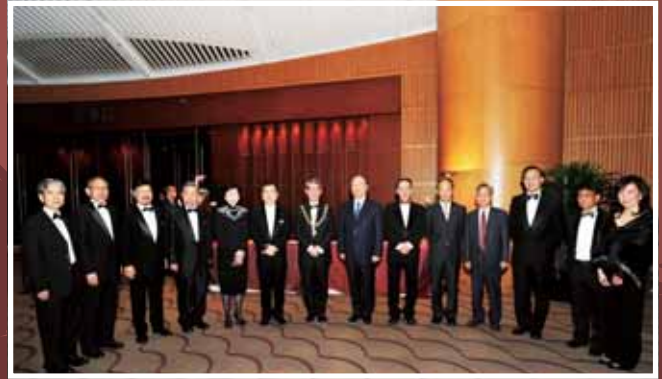
▼ The HKIE 35th Annual Dinner

On the international front, our status under the Washington Accord was verified and extended for six years during Session 2009/2010. In addition, all the computer science degree programmes accredited by the Institution are now recognised by other signatories of the Seoul Accord, including Australia, Canada, Chinese Taipei, Japan, Korea, the UK and the US.