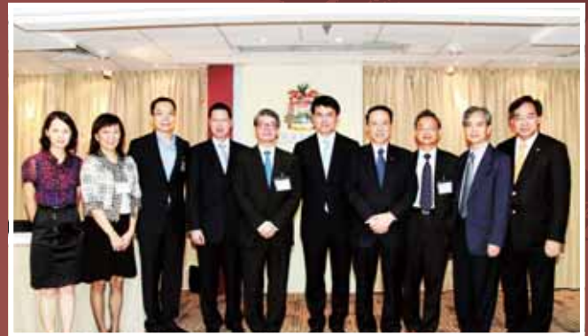
▲ 學會舉辦「空氣質素指標檢討」論壇