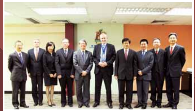
▼ 皇家航空協會到訪學會總部

在國際層面上，學會作為華盛頓協議成員的身份再次獲得確認，為期六年。此外，所有獲本學會認可的電腦科學學士課程現在也獲得各首爾協議成員的認可。首爾協議的成員包括澳洲、加拿大、中華台北、日本、韓國、英國及美國。