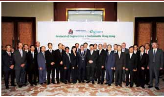
▲ 會長與各會員共同簽署《構建可持續香港議定書》