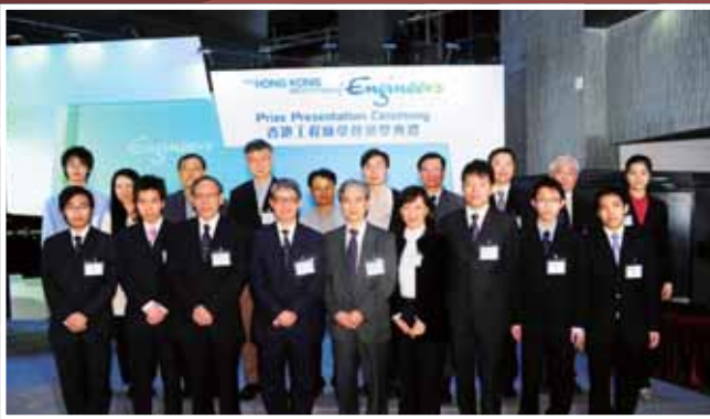
▲ The HKIE Prize Presentation Ceremony