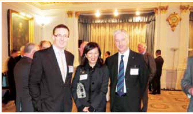
▼ 秘書長與英國分部會面