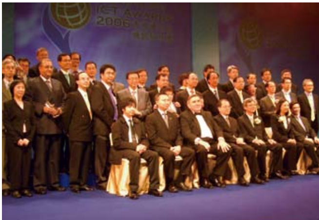
Presentation Ceremony of ICT Awards 2006

The success of the activities organised or sponsored by the Division relies on the support, contribution and participation of members. Sincere thanks go to members for their support over the past several years and I look forward to their continuous support in future.