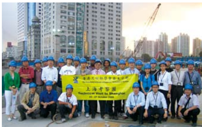
Technical Visit to Shanghai