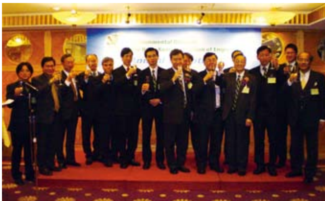
Toast at Annual Reception of Environmental Division

Sincere thanks go to all Division Committee members for their valuable time and effort to the Division in arranging the interesting site visits and inviting renowned speakers for technical seminars.