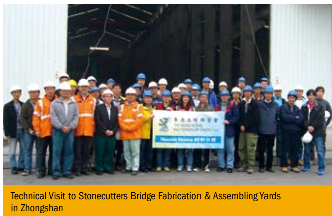
Technical Visit to Stonecutters Bridge Fabrication & Assembling Yards in Zhongshan

At last, sincere thanks are given to all Division members, especially Division Committee members and helpers, all seminar speakers, fellow engineers and academics as well as friends everywhere for their support, kindness and willingness to join us for the sake of material science and engineering development.