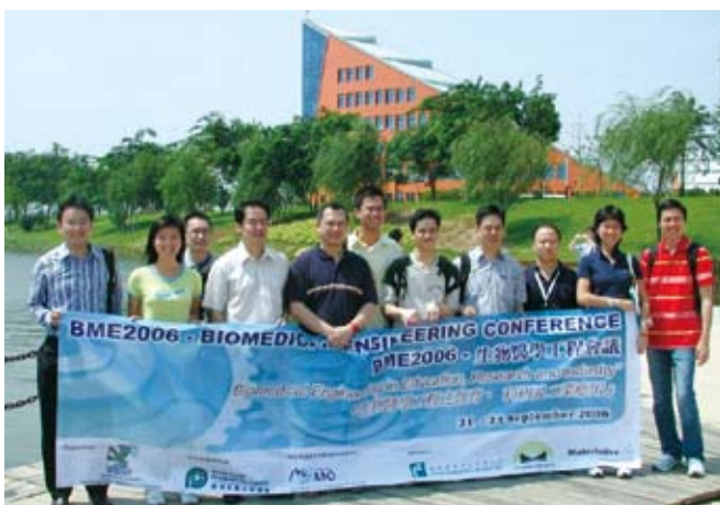
BME2006 Biomedical Engineering Conference