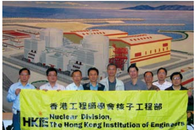
Technical Visit to Nuclear Power Base in Guangdong

development of the next generation of nuclear reactor on the Mainland and the progress of the research in fusion technology, we would strive to organise a wide range of activities for our members and reinforce the links with our counterparts on the Mainland and overseas so as to keep up with the development in the nuclear engineering field and emerging new technologies.