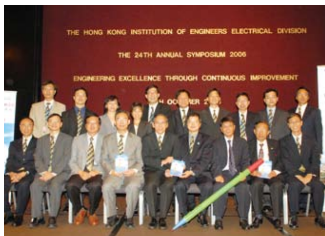
Launching Ceremony of “EE筆寫 – 香港電機工程發展趣誌” published by Electrical Division

The Chairman is very grateful to Division Committee members for their support and hard work to make this Session a success.