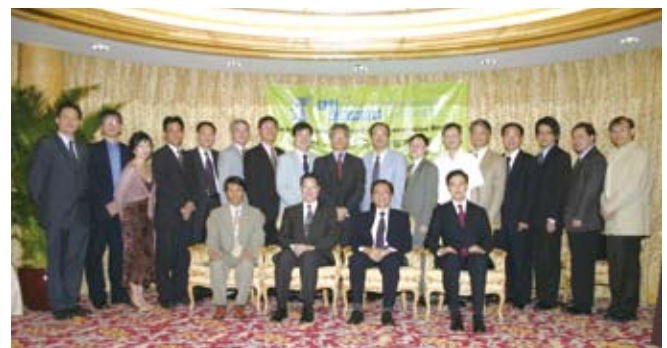
Annual Dinner of Control, Automation & Instrumentation Division

I am proud of the accomplishment of the Division in the Session and I am very grateful for the active participation and hard work of the members of the Division Committee.