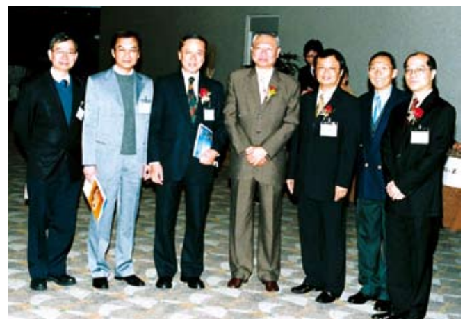
Annual Seminar of Building Division