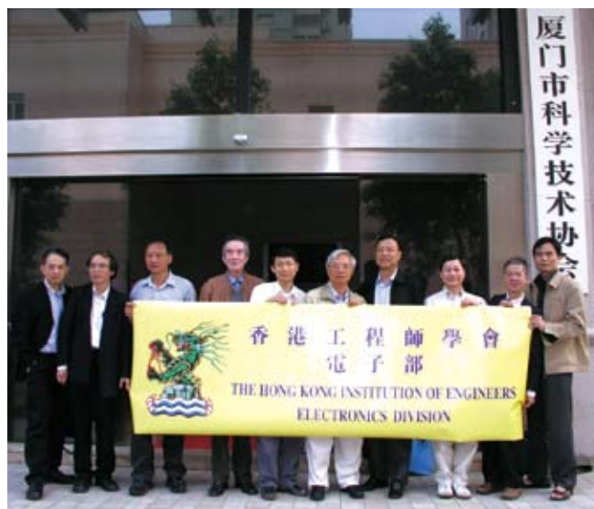
Technical Visit to Xiamen

Division activities are already scheduled for the coming summer and these are only possible with the diligence and enthusiasm of Division Committee members. The success of the Division belongs to them.