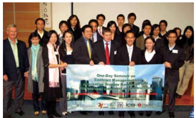
One-day Seminar on Contract Management, Alternative Dispute Resolution and Professional Indemnity in Construction

This Session has been fruitful for YMC. I would like to thank all Committee members for their support throughout the period. We will continue to organise quality events for members of the Institution.