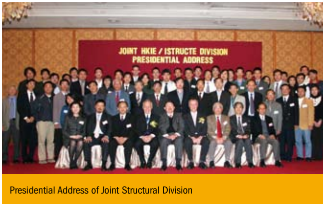
Presidential Address of Joint Structural Division

The activities of the Joint Structural Division would not have been realised without the staunch support by our members. Our Committee members have devoted much of their time and energy to ensure smooth running of the Division.