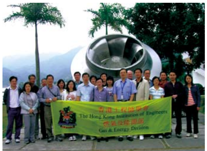
Technical Visit to Guangzhou Pumped Storage Power Station

We had a very fruitful year in Session 2006/2007. Similar to the last Session, members actively participated in Division's activities. They attended our technical talks and joined our technical visits with enthusiasm. Their support and great participation brought another successful and meaningful year to the Gas & Energy Division.