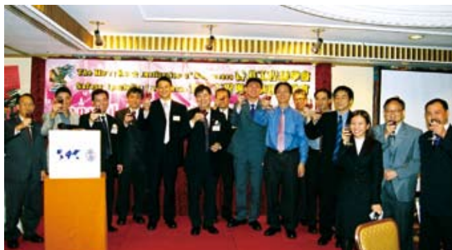
Annual Dinner of Safety Specialist Committee

Last but not least, I would like to take this opportunity to thank all elected members of the Committee for their support and assistance during the year.