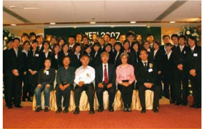
Opening Ceremony of YEP! 2007

To conclude, I am pleased to say that the Division Committee of the Session has done the best and set a solid path for coming years. I look forward to bigger success in coming Sessions and would like to have your continuous support to the Division in the next Session.