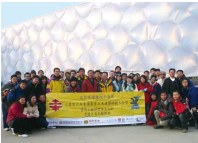
Mainland Civil & Construction Technology Winter Camp for Youth of Hong Kong 2006

Lastly, one of our ultimate goals is to strengthen the Division Committee. The organisation of the Division Committee has been strengthened to ensure adequate supports are available for sustainable development of the Division. New sub-committees incorporating members outside the Division Committee provided fundamental manpower resource to support the growth of the Division. This arrangement provided an opportunity for our Division members, in particular the young generation, to participate in the exciting and rewarding work of the Division.