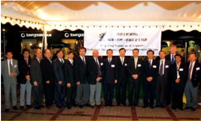
Cocktail Reception 2006 of Mechanical, Marine, Naval Architecture & Chemical Division

platforms for communication among members, enhancing members' knowledge through a series of activities, and attracting more young people with potentials to join the profession.