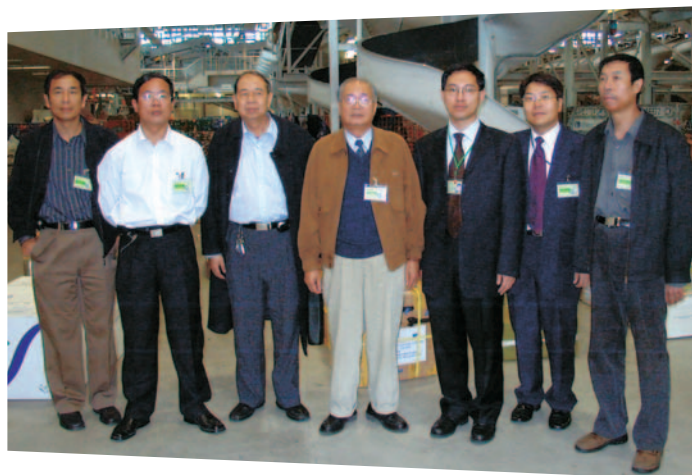
Visit to Airport Mail Centre at Chek Lap Kok Airport with the Delegation of the China Association of Automation

The success of the Division is the result of the work and support of Committee members and helpers, and in particular, the Division's office bearers.