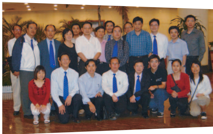
Technical visit to Guangzhou Administration Bureau of Work Safety

Safety organisations including the Labour Department, Occupational Safety & Health Council, Hong Kong Occupational Safety & Health Association, Construction Industry Training Authority and Institution of Occupational Safety & Health were invited to discuss current safety issues with members. The role of engineers in the safety field and the possible scenario of Safety Discipline were also discussed.