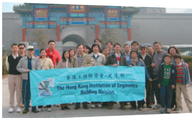
Beijing Delegation at the Great Wall

The Division held its Annual General Meeting (AGM) and the Annual Dinner on 29 April 2005 at the Kowloon Shangri-La Hotel.