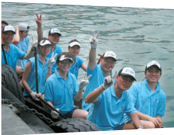
Division Committee Members participating in the Dragon Boat Race

The success of the Division in the 2004/2005 Session was attributed to the hard work of the Committee Members and the support of its members.