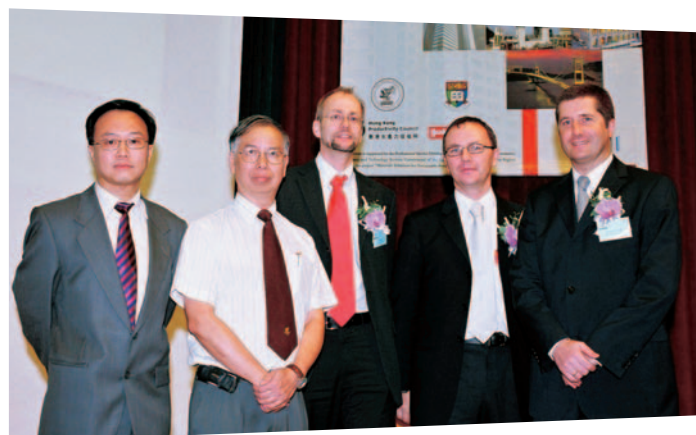
Seminar on Fastening Technology

By cooperating with other divisions and sister organisations, the Division expects to widen its scope of activities with a view to reaching out to more fellow engineers.