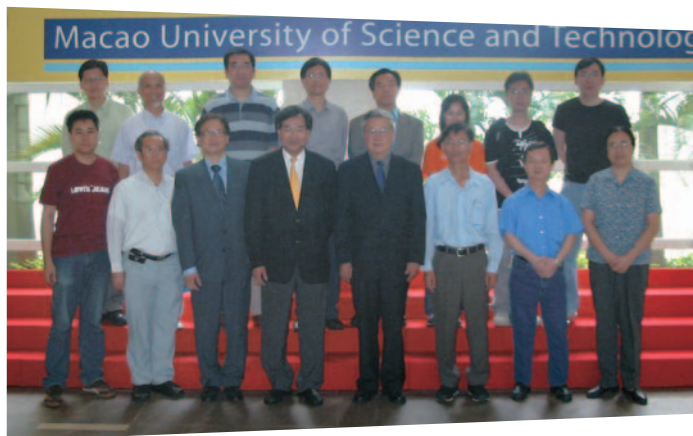
Technical Visit to Macao University of Science and Technology

With this foundation, the IT Division is in a strong position to promote sustainable excellence in the IT industry. Along that line, the HKIE continues to chair a task force on Professional Qualification for IT Practitioners, which has representation from 14 IT organisations and societies. In the future, much more work is needed to promote excellence in the application of engineering principles on large IT projects.