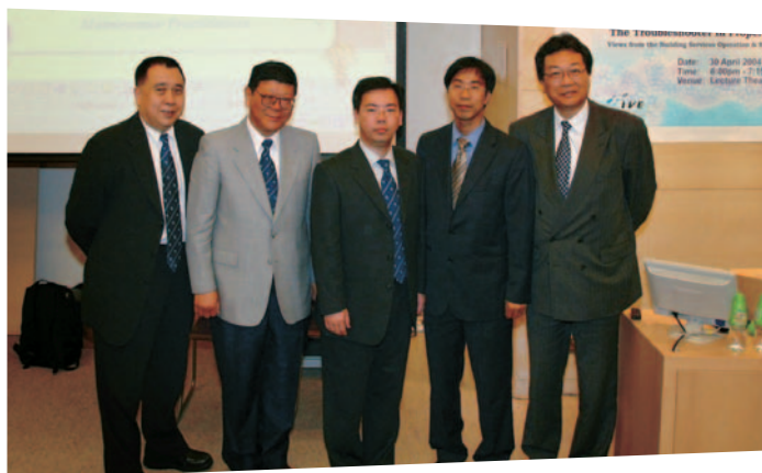
Technical Talk on "The Troubleshooter in Property Management"

Division members were involved in various task forces, committees, and working groups – some at the invitation of Government departments, others at the invitation of individual projects. Work in this area ranged from the West Kowloon Cultural District Project and the Buildings Department's Plumbing & Drainage Regulation Review to the Fire Safety Advisory Group and Ventilation Liaison of the Fire Services Department. Other working groups looked at the Code of Practice on Grid Connection of the Electrical and Mechanical Services Department; the Change of Cable Colour; the Building Services Code Review, and the Code of Practice on General Specification for Lift & Escalator Installation and Cooling Tower.