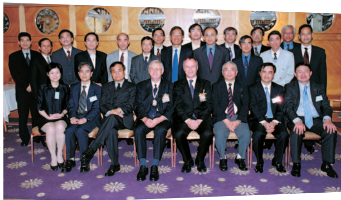
Group photo at the Annual Dinner

Special thanks go to senior members and Division Committee Members for the Division's successes during the Session.