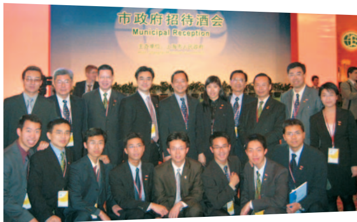
Delegation at the World Engineers' Convention 2004, Shanghai

However, the above achievements could not be attained without the support from other divisions and committees, institutions, societies and associations. The YMC sincerely thanks everyone who has been involved, in particular the members of the HKIE for their continuous support. The YMC promises to continue its excellence in the future.