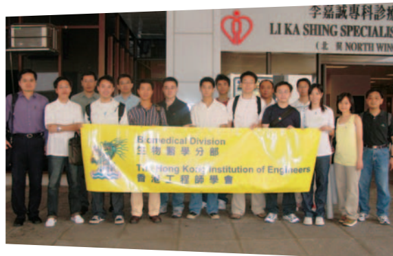
Technical Visit to the Prince of Wales Hospital

The Biomedical Discipline was successfully formed and the Scheme 'A' training programme for the Discipline was established. Efforts were made to recruit the