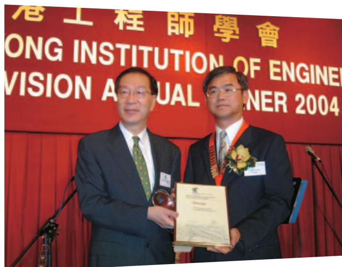
Chairman of Civil Division presenting the Most Contributing Organisation Award to the Director of Civil Engineering and Development at the Division Annual Dinner

The 2004 Civil Engineering Papers of the Year Award again received strong support with 11 papers submitted.