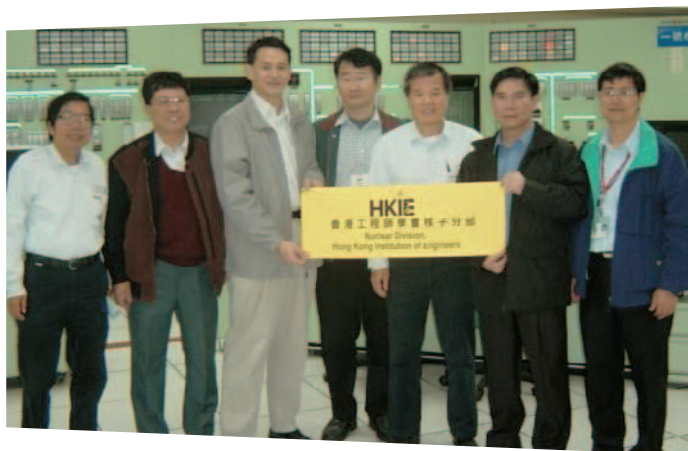
Group photo taken at the Main Control Room of NPP-2 at Wan Li Township during Taiwan visit