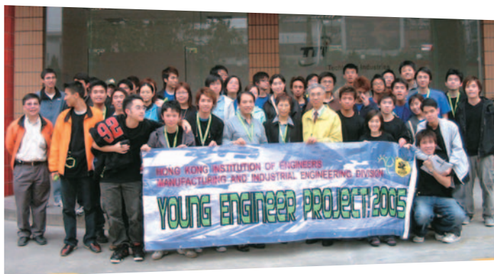
Group photo of YEP!2005

YEP!2005 was organised to enable undergraduates of the Manufacturing & Industrial Discipline to understand the industrial environment of Hong Kong and the Pearl River Delta Area. This was the fourth year since the programme began in the 2001/2002 Session, which included technical talks, industry visits in Hong Kong, Shenzhen and Dongguang, as well as presentations of findings by students. 30 students from five universities and IVE were selected from different grades to participate in the programme. The Closing Ceremony, which marked the end of the programme, was held on 9 April 2005.