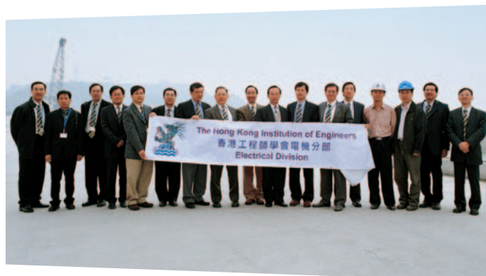
Delegation at the Three Gorges