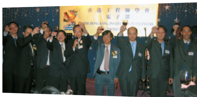
Electronics Division Annual Dinner

To improve the continuity of the Division's culture and development, Past Chairmen have been invited to be advisors to the Division Committee. With their presence and the support of fellow members, the Division will grow from strength to strength.