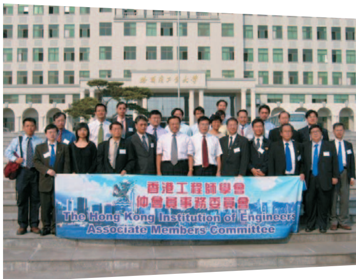
Annual Visit to Shandong Province

The success of the AMC in this Session was due to the contribution of all Committee Members.