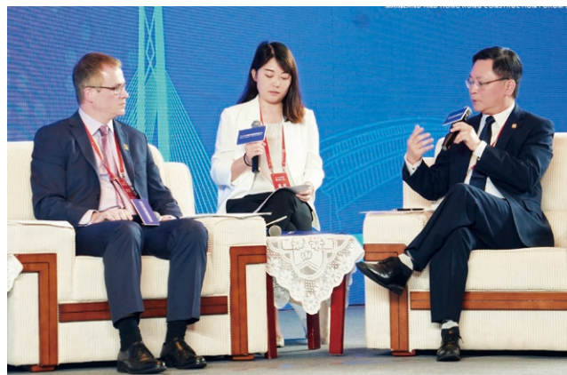
薛秘書長參與2024內地與香港建築論壇的專題討論