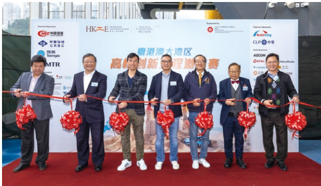
Guangdong-Hong Kong-Macao Greater Bay Area Tertiary Institution Innovation Project Invitational Competition