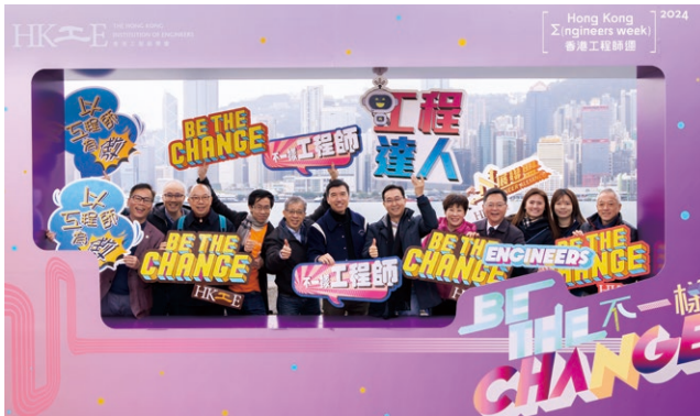
The Hong Kong Engineers Week 2024 Carnival

As a recognised qualifying body, it is imperative that we maintain consistent engagement with our international counterparts. Our delegations to Australia, Canada, Dubai, and the UK, scattered over the year, have each in their own way served as a rich repository of exchange opportunities, broadening our professional perspective. From February to March 2024, moreover, a Sydney Accord review panel observed our accreditation visit to the Hong Kong Institute of Vocational Education, including its delivery sites such as Shenzhen Polytechnic University. The panel meticulously observed the decision meeting of the HKIE Accreditation Committee for Higher Diploma Programmes in May 2024, successfully completing the once-every-six-year periodic review. Such review ensures that the accreditation of the Institution aligns with global standards.