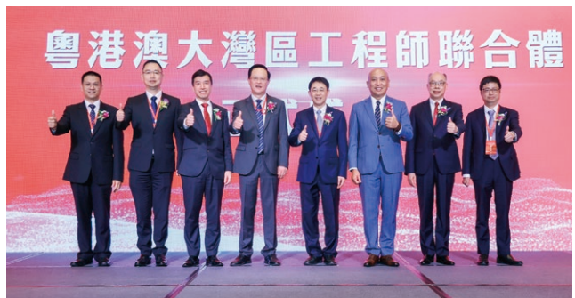
Establishment of The GBA Federation of Engineering Organisations (粵港澳大灣區工程師聯合體)