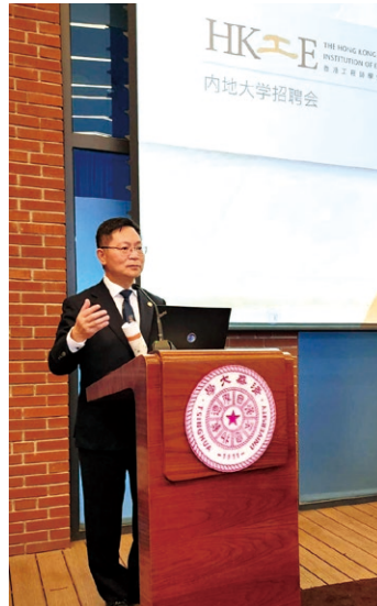
Career fair at Tsinghua University

While we welcomed over 3,012 newly admitted members to the Institution this year, we continue to focus on nurturing the future generation of engineers and promoting the engineering profession. As part of this effort, we participated in career fairs at universities in the Mainland, the UK, Canada, and Australia from October 2023 to May 2024, collaborating in many instances with the Development Bureau and the industry to introduce our professional qualifications and advocate our spirit of professionalism. We visited 13 universities in major Mainland cities and two universities each in the UK, Canada, and Australia, aiming to recruit talented individuals and address the shortage of professionals in the industry.