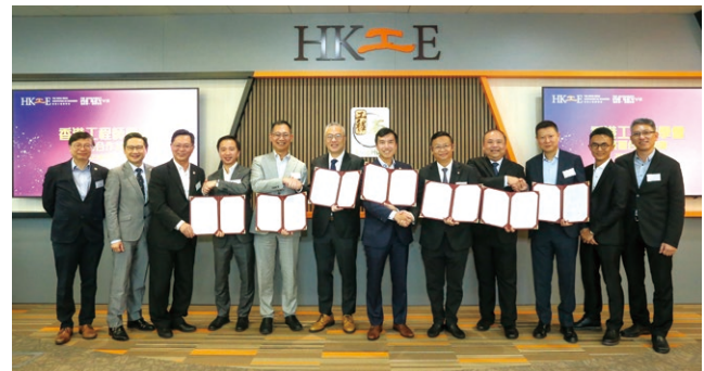
Signing ceremony of co-operation agreements with six leading corporations