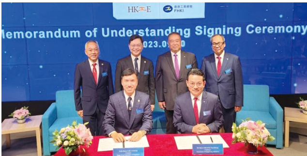
Signing Memoranda of Understanding with the Federation of Hong Kong Industries

2024, the Innovative Technologies in Urban Transportation Seminar, and the International Council on Electrical Engineering Conference 2023 have provided invaluable platforms for participants to share insights into emerging trends. Through collaborative initiatives with the Mainland and the HKSAR governments, the Guangdong Association for Science and Technology, and The Guangdong Institution of Engineers, our members have gained eligibility to apply smoothly for professional titles (職稱) in the Mainland, facilitating enhanced access to the Mainland market. The official establishment of The GBA Federation of Engineering Organisations (粵港澳大灣區工程師聯合體) at the Third Greater Bay Area Engineers Forum has united engineering organisations and coalesced professional communities within the Guangdong-Hong Kong-Macao Greater Bay Area. These gatherings of forces have contributed to the free flow of expertise, nurturing the advancement of engineering practices.