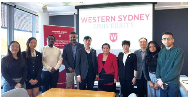
Visit to Western Sydney University during the Australia Visit