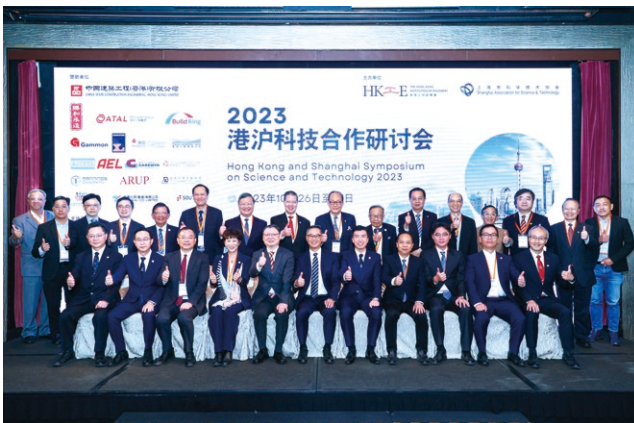
Hong Kong and Shanghai Symposium on Science and Technology 2023