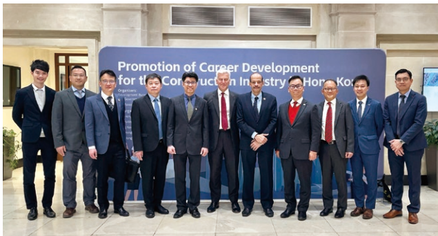
Career talks in the University of Leeds and University of Warwick with the Development Bureau

Further strengthening our commitment to fostering collaboration, the HKIE has entered into Charter of Co-operation agreements with six leading corporations, aiming to facilitate knowledge sharing, talent nurturing, and the promotion of sustained excellence in the engineering profession. We have also signed Charter of Co-operation agreements with two schools, namely Aberdeen Technical School and Sau Mau Ping Catholic Primary School, to promote STEAM education and inspire young minds in the field of engineering. Subsidiary agreements were also signed with five engineering institutions in Guangdong at the Third Greater Bay Area Forum to foster mutual recognition of membership qualifications in Civil, Control, Automation and Instrumentation, Electrical and Geotechnical Disciplines.