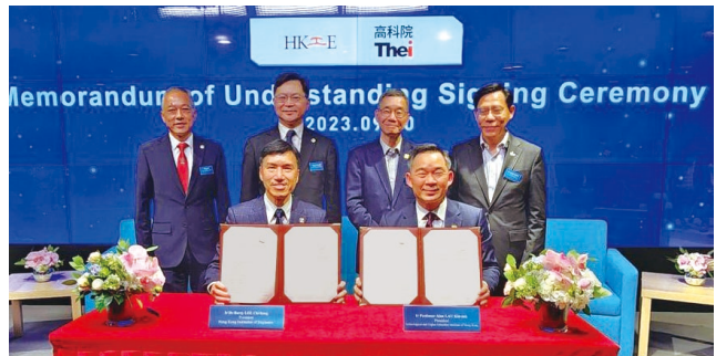
Signing Memoranda of Understanding with Technological and Higher Education Institute of Hong Kong