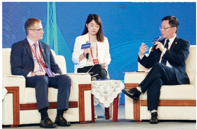
Joining the panel discussion at the Mainland and Hong Kong Construction Forum 2024