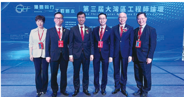
Third Greater Bay Area Engineers Forum