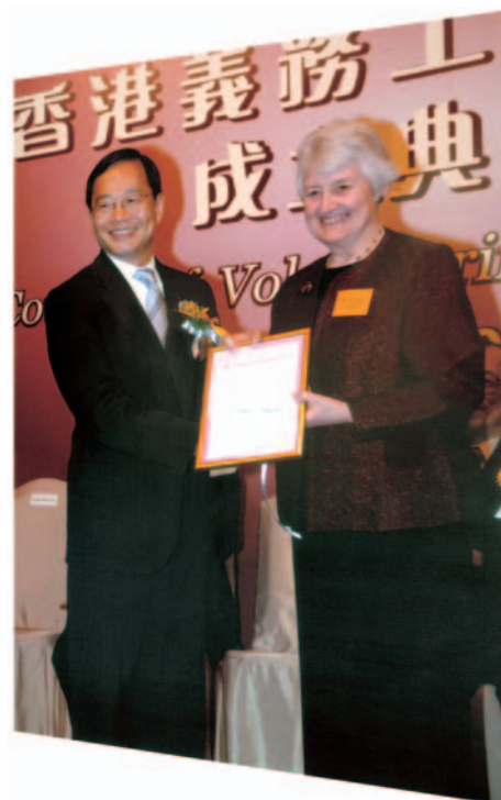
The President attended the inauguration ceremony of Hong Kong Council of Volunteering

Since the tsunami tragedy in South Asia at the end of last year, the HKIE has made great strides in building up a register of volunteers for the Red Cross, to provide support for water resource development in the tsunami-hit areas on a longer-term basis. This is the phase that needs the skills and knowledge of engineers most and I believe we should all take heart that our members' expertise is now being harnessed to help communities beyond Hong Kong, to rebuild and maintain the infrastructure of our tsunami-hit neighbours and provide them with a better living environment.