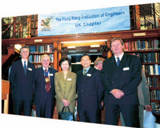
Presidential visit to UK Chapter in February 2005

The HKIE and the National Administration Board of Engineering Registration are now also actively considering the reciprocal recognition of geotechnical, electrical and supervising engineers, which would substantially open up the Mainland’s demand for Hong Kong engineering services in the future. In addition, talks are now well underway with the Guangdong Provincial Association for Science and Technology to boost co-operation and relations in the Pan Pearl River Delta Region, the fastest-growing area on the Mainland.