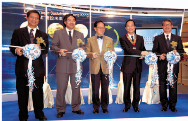
The opening ceremony of the HKIE Exhibition - Engineering a Sustainable Hong Kong

My presidential year has been one of great delight, warm fellowship and closer integration with the global community. Our members' enthusiastic participation, willingness to seek out new challenges and increased involvement in public affairs on the wider local, regional and world stage are truly beginning to make a difference to the Institution's image, profile and influence. We need and want you all to stay close to the Institution. I would like to thank everyone from the bottom of my heart for the wonderful privilege of being your President during Session 2004/2005.