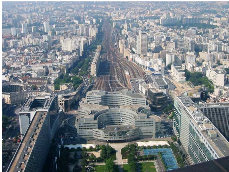
Paris Montparnasse Station

77. The other off town exceptions for a different reason could be found in the States where a down town location did not offer a greater access advantage in decentralized, widely dispersed US metropolitan areas. The Shinkansen in Japan was at the other end, where stations were in town center.